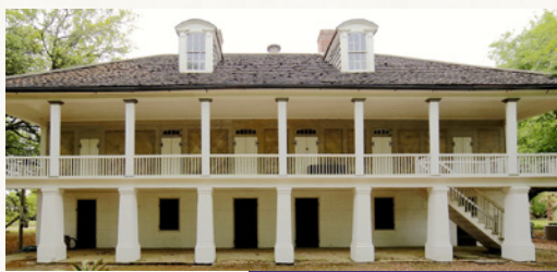
Mike Greenberg/Whitney Plantation

The Whitney Plantation is the only former plantation site in Louisiana with an exclusive focus on slavery. Generations of Africans and their descendants were enslaved here to establish and maintain indigo, rice, and sugar crops. This excursion includes a 90-minute guided tour to focus on the history of the site from 1830-1860. After the guided tour, guests will have an additional 60 minutes to explore other areas of the plantation on your own, including three museum exhibitions and an optional self-guided audio tour. This excursion also includes a buffet lunch at a restaurant on Lake Pontchartrain, including non-alcoholic drinks and up to two alcoholic drinks. The Whitney Plantation is about an hour's drive from the Ritz-Carlton New Orleans. You will spend 2.5 hours onsite, then drive about 30 minutes to the restaurant on the way back to New Orleans. The tour includes walking outdoors rain or shine on uneven gravel pathways and the ability to walk/stand for 90 minutes.